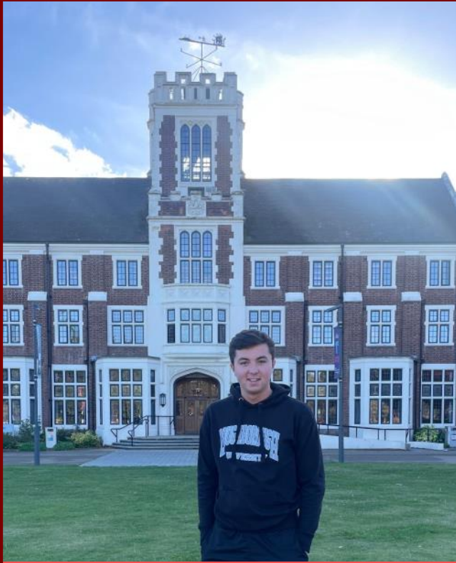
Oliver Management, Loughborough