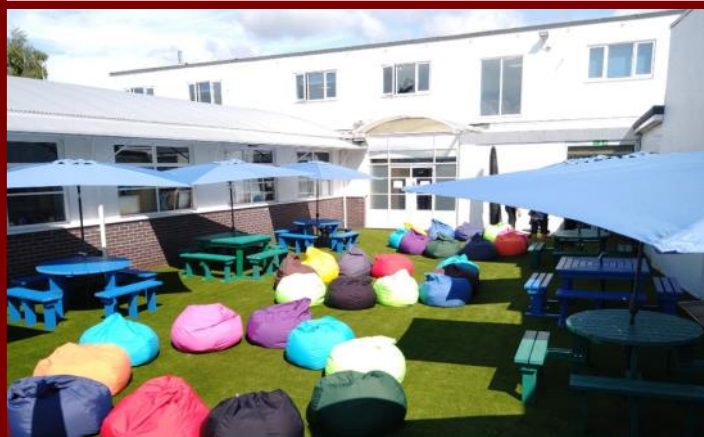
SIXTH FORM QUAD

Sixth Form Quad: the outdoor space adjoining G2 was fully refurbished in the summer of 2019, using funding from the Healthy Schools Capital Fund. The space gives students a place to relax during their breaks as well as study in the fresh air.